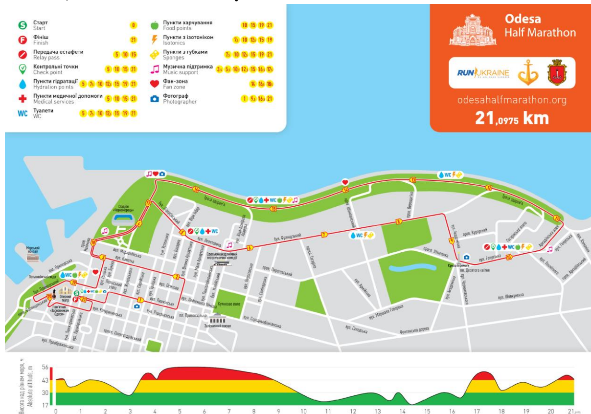
Route of the 10 km course:

PLEASE, NOTICE! The route may be altered!